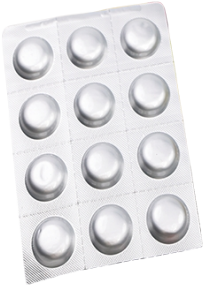
Blister Packaging Of Gummy