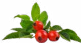
ROSE HIP EXTRACT