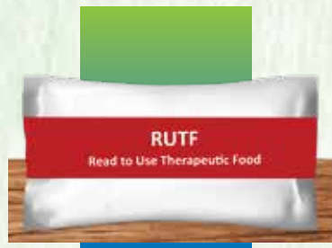
READY TO USE THERAPEUTIC FOOD (RUTF)