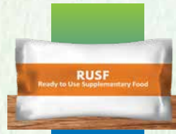
READY TO USE SUPPLEMENTARY FOOD (RUSF)